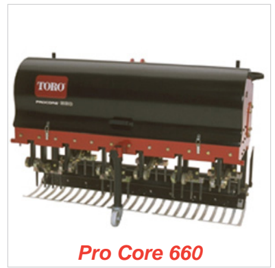
Pro Core 660

up pockets where the water can get down into the sub soil surface. This can benefit in a number of ways. You are encouraging roots to go down after the moisture and you can build up the natural moisture reserve of the sub-soil. With an aerification program, it will directly improve the quality of the grass. Aerification does this by improving the overall growing medium that the turf is required to grow in. Changing the rate of penetration for moisture so you do not have sitting water, the ability for gas and air to exchange, and encouraging roots to dive down to look for nutrients and moisture all lead to growing healthy turf that can sustain the majority of play on the surface.