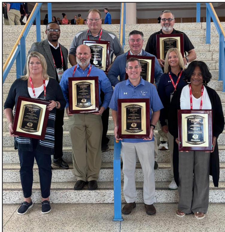
Pictured above, QPA Recognition Recipients BCPS Athletic Directors

That's why our not-for-profit organizations—the NFHS and the NIAAA —have produced new PSAs that tell the powerful story of school sports.