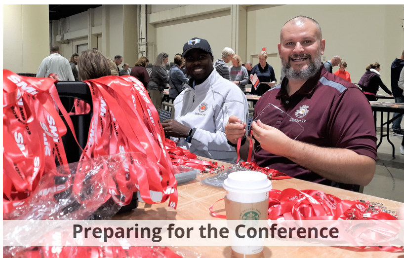
Preparing for the Conference