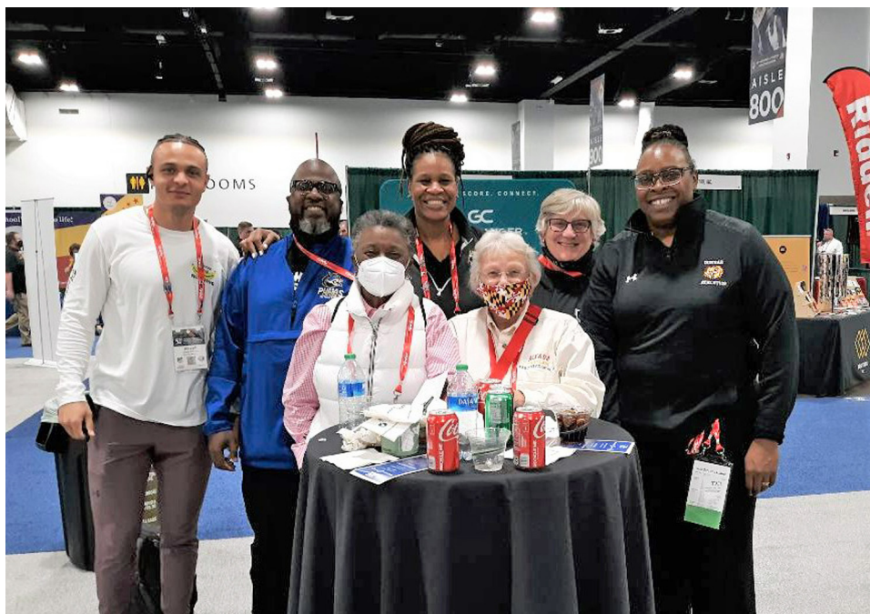
NADC Attendees from Maryland